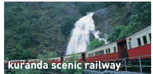
kuranda scenic railway

Skyrail is "The World's Most Beautiful Rainforest Experience" taking you on an unforgettable journey over and through Australia's World Heritage listed Tropical Rainforest. Glide just metres above the canopy in Skyrail's comfortable six-person gondola cabins, enjoying spectacular views of the rainforest, tropical Cairns, the Coral Sea and the lush Cairns Highlands. Travel time is approx. 1hr 30mins and there are two rainforest stations, Red Peak and Barron Falls, which provide the opportunity to explore and learn about this ancient environment. See map above for further information on Skyrail.