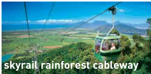
skyrail rainforest cableway

Today visitors flock to this tiny village to enjoy both the stunning natural beauty of the village, and the relaxed atmosphere of the local markets. The Heritage and Kuranda Markets are open 7 days a week selling unique souvenirs and gift items.